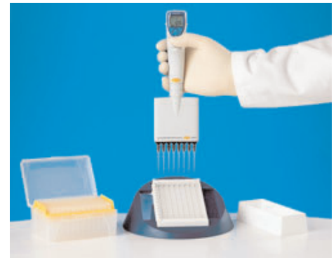
Photo illustrates the perfect solution to ergonomic and accurate pipetting.

For comfortable pipetting at a convenient angle